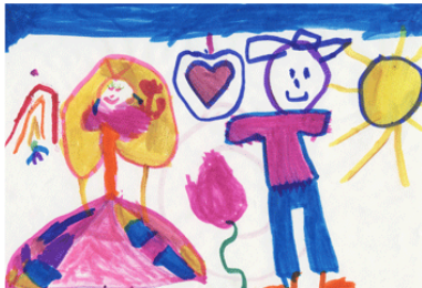
my mum and dad