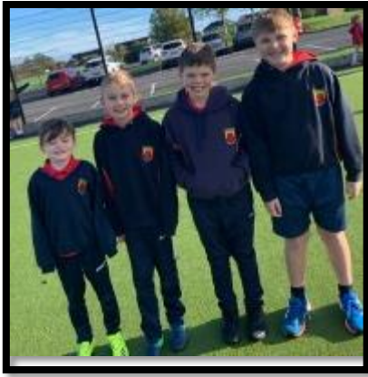
Pupils enjoying fun and friendship at breaktime